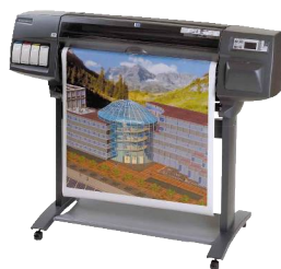
hp designjet 1055cm plus printer