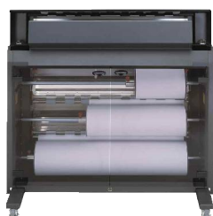
hp designjet multi-roll feeder

For CAD designers and GIS users who need to print high quality, large format outputs in order to review, communicate and document their designs, the HP Designjet 1000 plus series delivers the high performance and production speeds expected by large workgroups of 10 or more people.